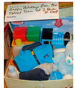
One of the many wonderful Holiday Spirit Gift Boxes for families.

One donor who dropped off an assortment of gift boxes told us that for her "it's a small gesture to let a family know they are special and deserve a nice holiday together."