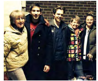
The Holiday Hampers group, long time holiday supporters delivered 105 turkeys with all the fixings!

For a complete list of holiday program supporters visit our website: reddoorshelter.ca/our-donors/holiday-2014