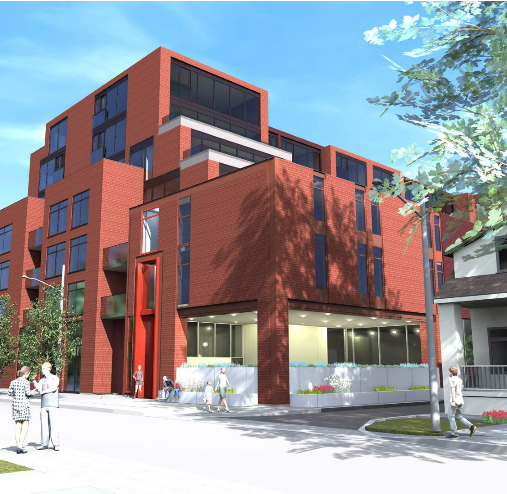
Future home of Red Door's family shelter at 875 Queen St. East