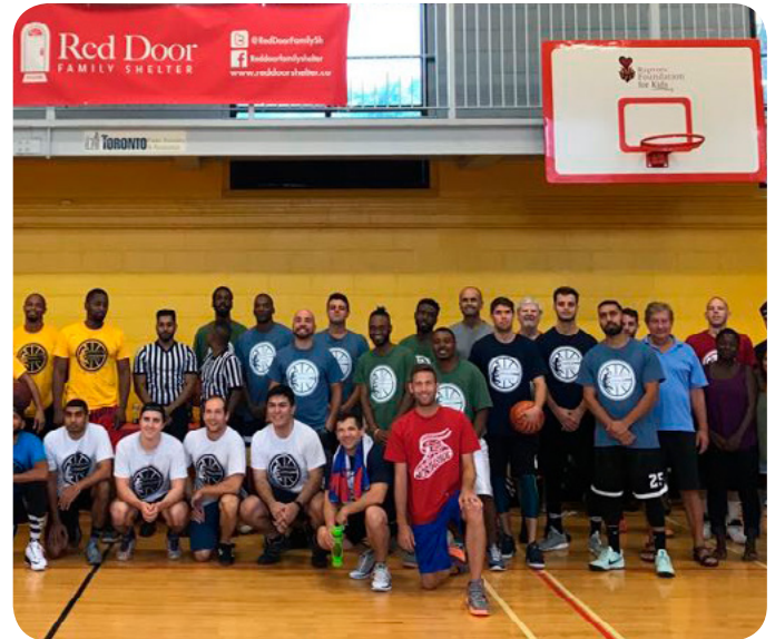
The Committee 3 on 3 Summer Classic Basketball tournament raised $6,000 to support programs for youth at the Red Door.