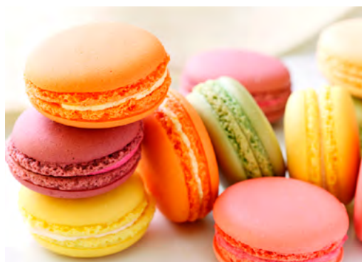
Macaron Day 2016 was a huge success with over $4000 raised.

From garage sales, to galas, and dance parties to brunches many supporters came together to make a difference for families in need at the Red Door. Thank you to all of our enthusiastic fundraisers for helping us continue to provide important programs and services for families in need.