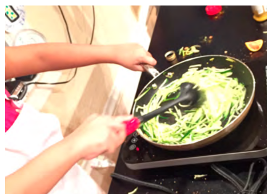
Homemade zucchini pasta was on the menu for the Taste of Home Program.

Learn more about our Children's Programs: reddoorshelter.ca/programs/children