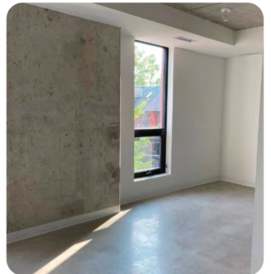
Bedrooms, soon to be furnished, will be bright, with private washrooms.