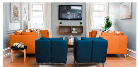
An amazing makeover of the TV room at our Pines shelter!