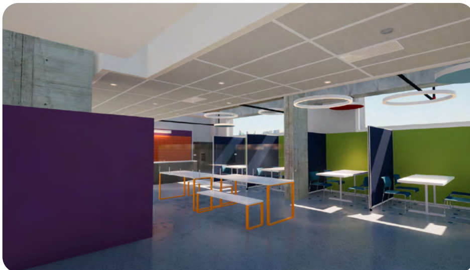
Artist's rendering of the new dining area. Foldable barriers between dining tables will provide both privacy and added safety to maintain physical distancing during COVID-19.