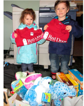
A touching donation from two young donors who brought in toys collected on their birthdays for children at our shelter for the holidays.