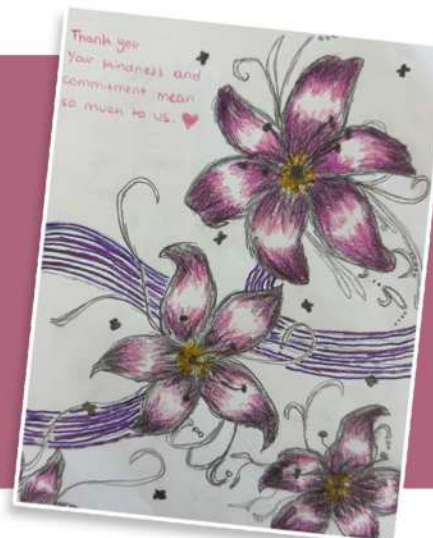
Art by a Red Door resident, age 15